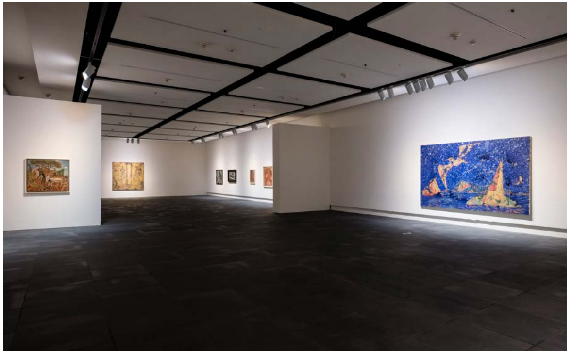
Exhibition view of Mao Xuhui: I am here , Kuandu Museum of Fine Arts, TNUA, Taipei, Taiwan 《毛旭輝 · 我就在這兒》展覽現場 | 台北國立藝術大學關渡美術館 | 台北 | 台灣