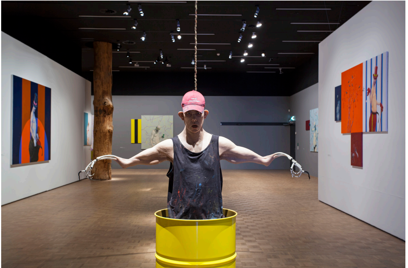
Circus Europa , Arken Museum of Modern Art, 2018 《歐洲馬戲團》，方舟現代美術館，2018

According to the artist, “humans tend to always move away from the uncomfortable. There is a great danger in avoiding discomfort and I find it interesting to explore this discomfort – it must be there for a reason. It must contain some kind of honesty, which we should take seriously”.